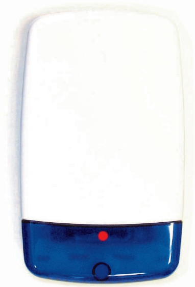
AZ-TECH Dummy Bell Box